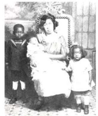
Jacob Lawrence (left) his mother and siblings, 1923.

Lawrence was born on September 17, 1917 in Atlantic City, New Jersey. He was the eldest of three children. Jacob’s father abandoned the family in 1924, leaving Jacob’s mother struggling to support her young family. They moved to Philadelphia but she was unsuccessful in finding work to support the family, she moved to New York and the children spent several